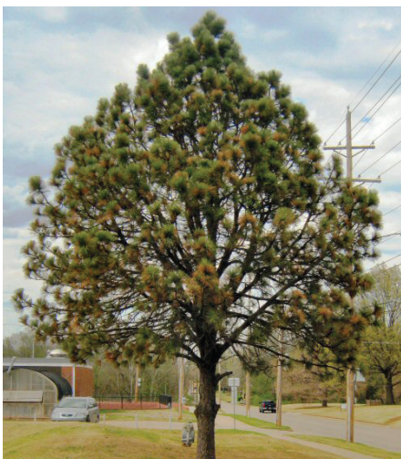
Figure 3. Premature defoliation (especially of lower needles) often occurs with Dothistroma needle blight.

Oklahoma State University, in compliance with Title VI and VII of the Civil Rights Act of 1964, Executive Order 11246 as amended, Title IX of the Education Amendments of 1972, Americans with Disabilities Act of 1990, and other federal laws and regulations, does not discriminate on the basis of race, color, national origin, gender, age, religion, disability, or status as a veteran in any of its policies, practices, or procedures. This includes but is not limited to admissions, employment, financial aid, and educational services.