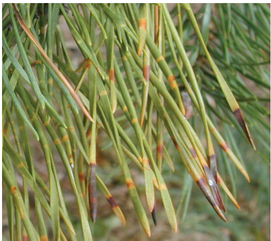
Figure 1. In the fall, early symptoms of Dothistroma needle blight appear as spots or bands on the needles that may have a water-soaked edge.