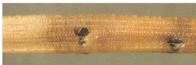
Figure 5. By January, erumpent, black fruiting structures develop on blighted needles.