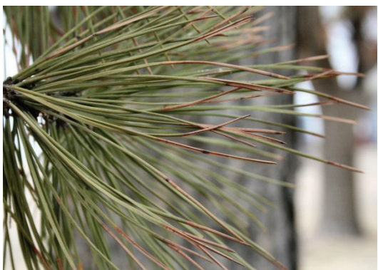
Figure 2. As the symptoms of Dothistroma needle blight progress, the tips of the needles may turn reddish brown while the needle bases remain green.