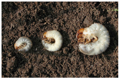
Figure 3. Larvae of 3 species of white grubs (left-right): Japanese beetle, European chafer, May/June beetle.