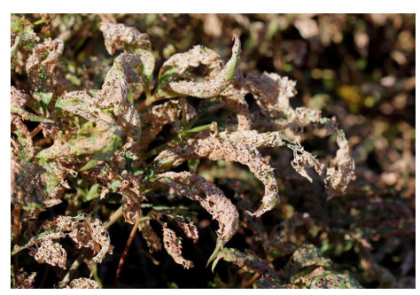
Figure 5. Leaf injury to Virginia creeper foliage by Japanese beetle adults.

tissues, notably flower petals; rose flowers are particularly susceptible to Japanese beetle injury. Damage on individual plants may be patchy, concentrated where aggregations of feeding beetles occur.