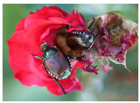
Figure 1. Rose blossoms are one of the most highly favored foods of Japanese beetles.

Japanese beetle larvae are a type of white grub that feed on the roots of grasses. They have a creamy white body with a dark head