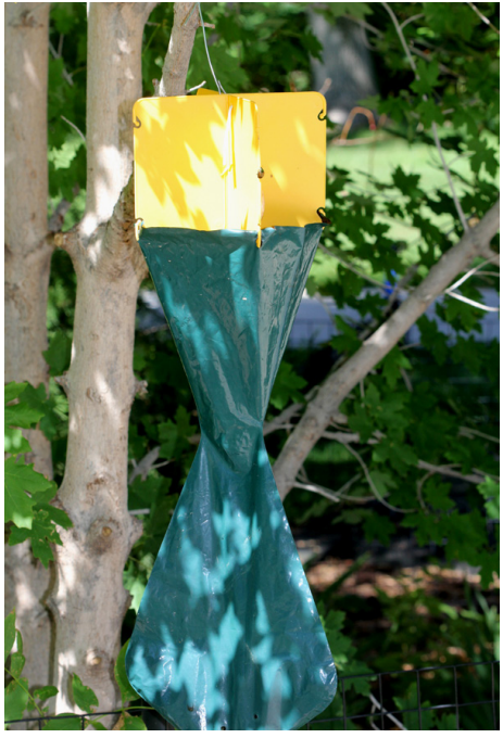
Figure 6. Typical trap used to capture adults of the Japanese beetle.

Larvae continue to feed until soil temperatures drop to about 60°F at which time the larvae move deeper in the soil where they remain through winter. All activity ceases when soil temperatures drop