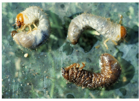
Figure 7. A white grub (lower right) that has been infected and killed by the insect parasitic nematode Heterorhabitis sp. Insects infected by this nematode turn a reddish-brown color.

Another biological control that has received considerable past attention for Japanese beetle control is milky spore ( Bacillus popilliae ), a bacterium that produces 'milky disease' in Japanese beetle